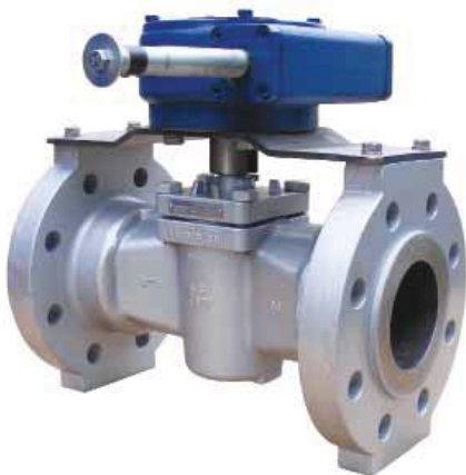
ANSI/ASME Class 600 Lbs FluoroSeal ® Plug Valve

The inside diameter of the formed PTFE diaphragm, adjacent to the plug stem, is also contained by means of a unique lip design of the formed metal diaphragm preventing extrusion and maintaining the stem seal throughout variable service conditions. This uniquely formed metal diaphragm also provides a positive electrical ground between the plug and body, eliminating the need for an extra component to fulfill this function as is the case for other valve manufacturers' designs.