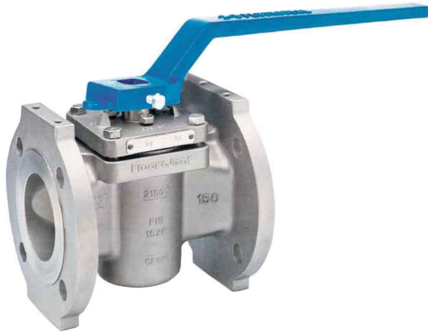
ANSI/ASME Class 150 Lbs FluoroSeal® Plug Valve with Wrench