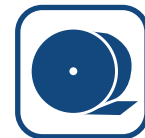
Pulp & Paper